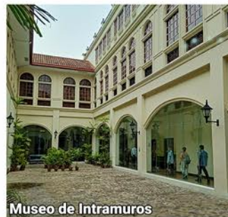
Museo de Intramuros