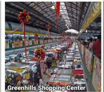
Greenhills Shopping Center