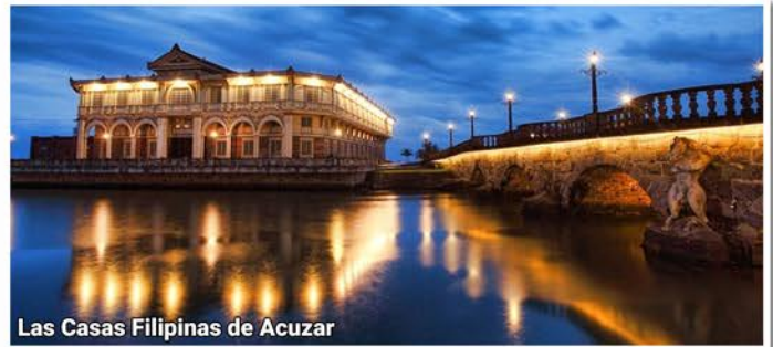
Las Casas Filipinas de Acuzar