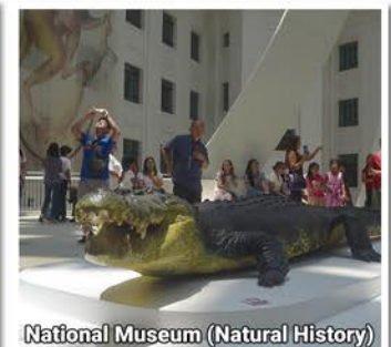
National Museum (Natural History)