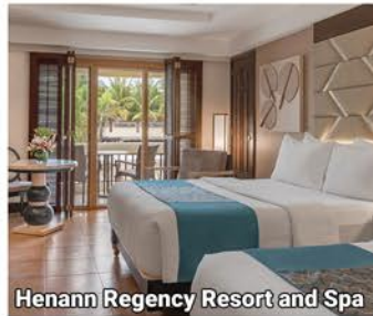
Henann Regency Resort and Spa