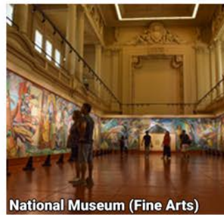
National Museum (Fine Arts)