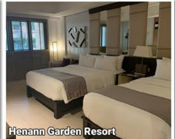
Henann Garden Resort