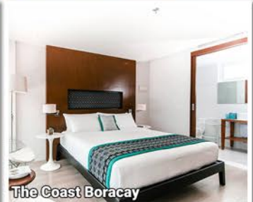
The Coast Boracay