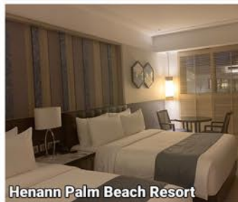
Henann Palm Beach Resort