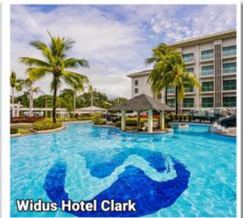
Widus Hotel Clark