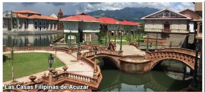
Las Casas Filipinas de Acuzar