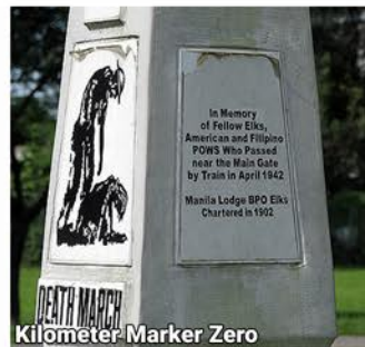
Kilometer Marker Zero